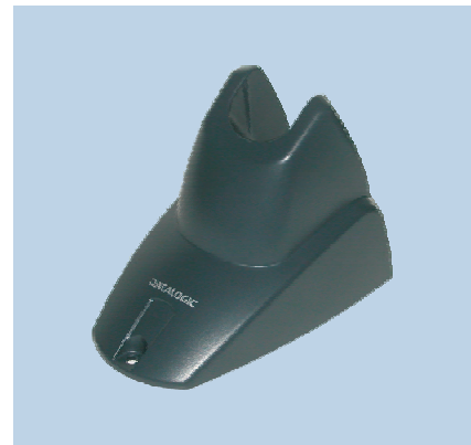
STD Heron™ Hands-Free Stand